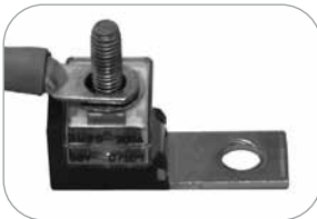
Fig. 6. Fuse MRBF and cable lug inserted into the stud of the CFBAR

B. Insert the cable lug (crimped to one end of the Positive battery cable) onto the CFBAR stud so that it sits over the fuse MRBF. See Fig. 6.