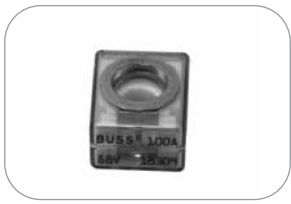
Fig. 1. Marine Rated Battery Fuse (MRBF)