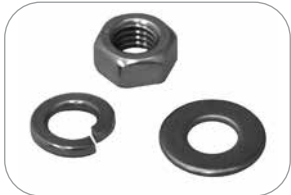
Fig. 3. M-8 Nut, Flat Washer and Spring Washer