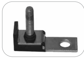
Fig. 2. Clamping Fixture Bar (CFBAR) or Single Pole Fuse Bar