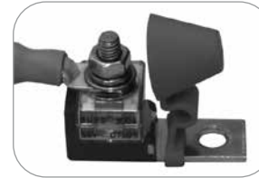
Fig. 8. Insulating Cap slid over the rectangular portion of CFBAR

D. Slide the Insulating Cap onto the rectangular strip of the CFBAR and then insert the hood portion onto the exposed portion of the stud of the CFBAR. See Figures 8 and 9.