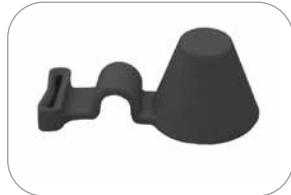
Fig. 4. Insulating cap