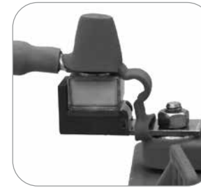
Fig. 10. Installed arrangement

E. Bolt the CFBAR to the Positive terminal stud of the Battery usually denoted by the '+' sign as shown in Fig. 10.