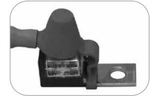
Fig. 9. CFBAR with fitted fuse MRBF

E. Bolt the CFBAR to the Positive terminal stud of the Battery usually denoted by the '+' sign as shown in Fig. 10.