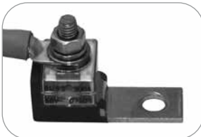
Fig. 7. Fuse MRBF and Positive cable fixed to the CFBAR

C. Insert the flat washer, the spring washer and the M-8 nut on to the CFBAR stud and tighten the nut with a 1/2" wrench. See Fig. 7.