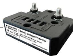
Battery Voltage Protector