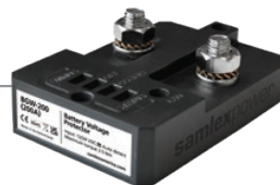
Battery Voltage Protector