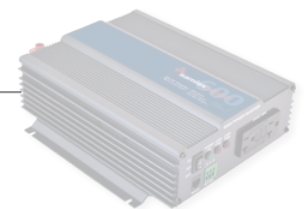
Inverter / DC Load

NOTE: Please refer to the manual for detailed installation instructions.